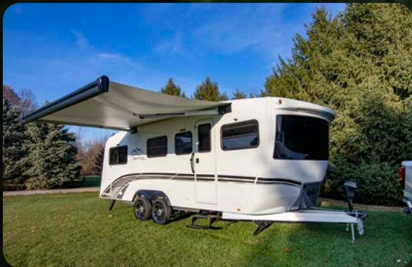
14' Power Awning