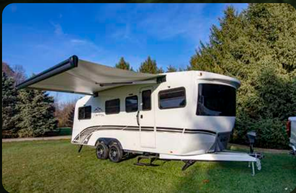
14' Power Awning